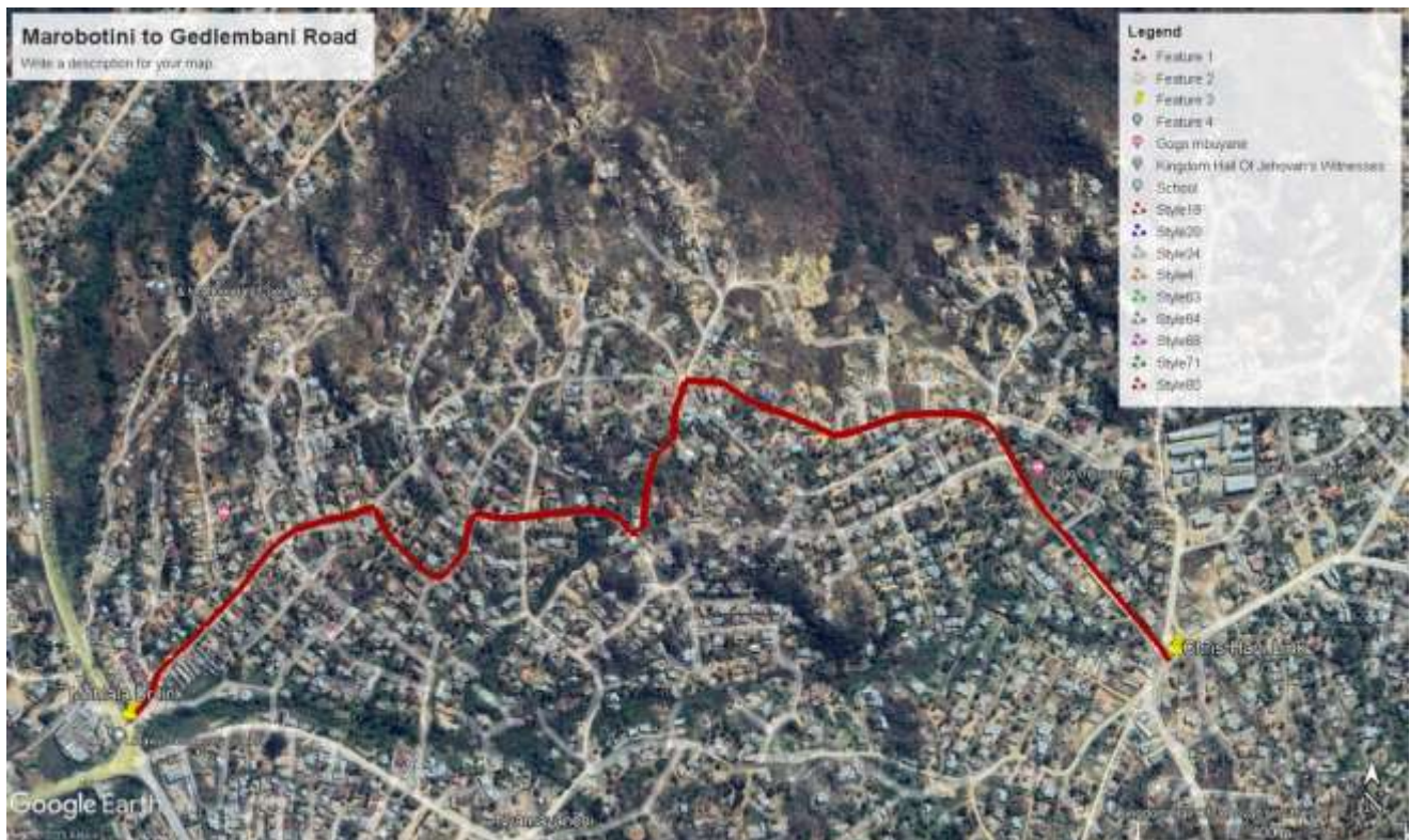
Figure 1: Locality Plan of the Project

The proposed site is located about 30km east of Mbombela at Mohlala Drive in Msogwaba currently forming part of the City of Mbombela Local Municipality and City of Mbombela in Mpumalanga Province. The proposed road is easily accessible by heavy and light moving vehicles through Mohlala Drive or Chris Hani Drive. The centre coordinates for the proposed site are Latitude: 25°24'18.00"S, Longitude: 31° 9'1.67"E. The proposed site locality map is shown in Figure 1 below.