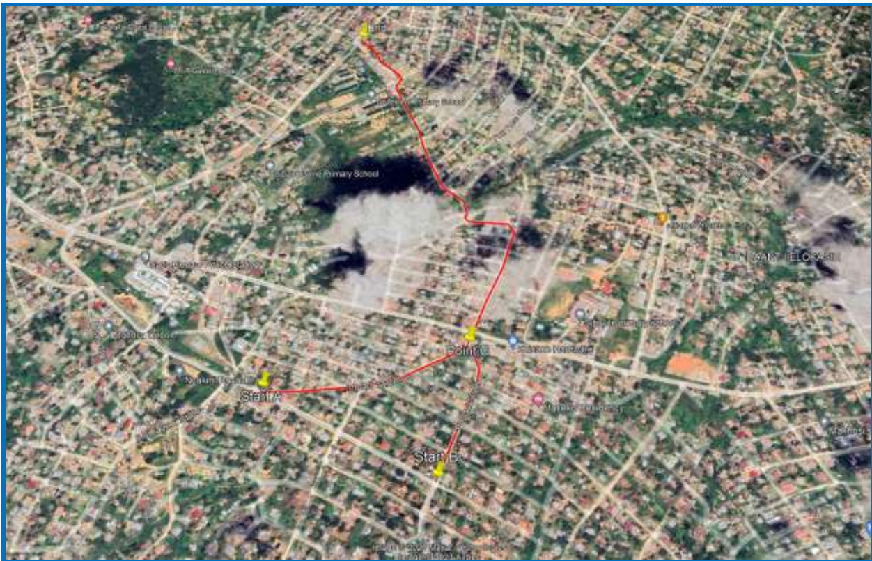
Figure 1: Locality Plan of the Project Areas

The start of the road is at Lat: 25°26'12.92"S, Long: 31°11'14.45"E and ends at Lat: 25°25'37.10"S Long: 31°11'20.43"E. The road crosses a major stream on one of the streets, named Come Duze Street. The road to be upgrade starts at the surfaced Khekhe Road, then intersects an unnamed Provincial Road and end at Nkomene Road. The approximate length of the road is 2.1km. The locality plan is presented in Figure 1 below.