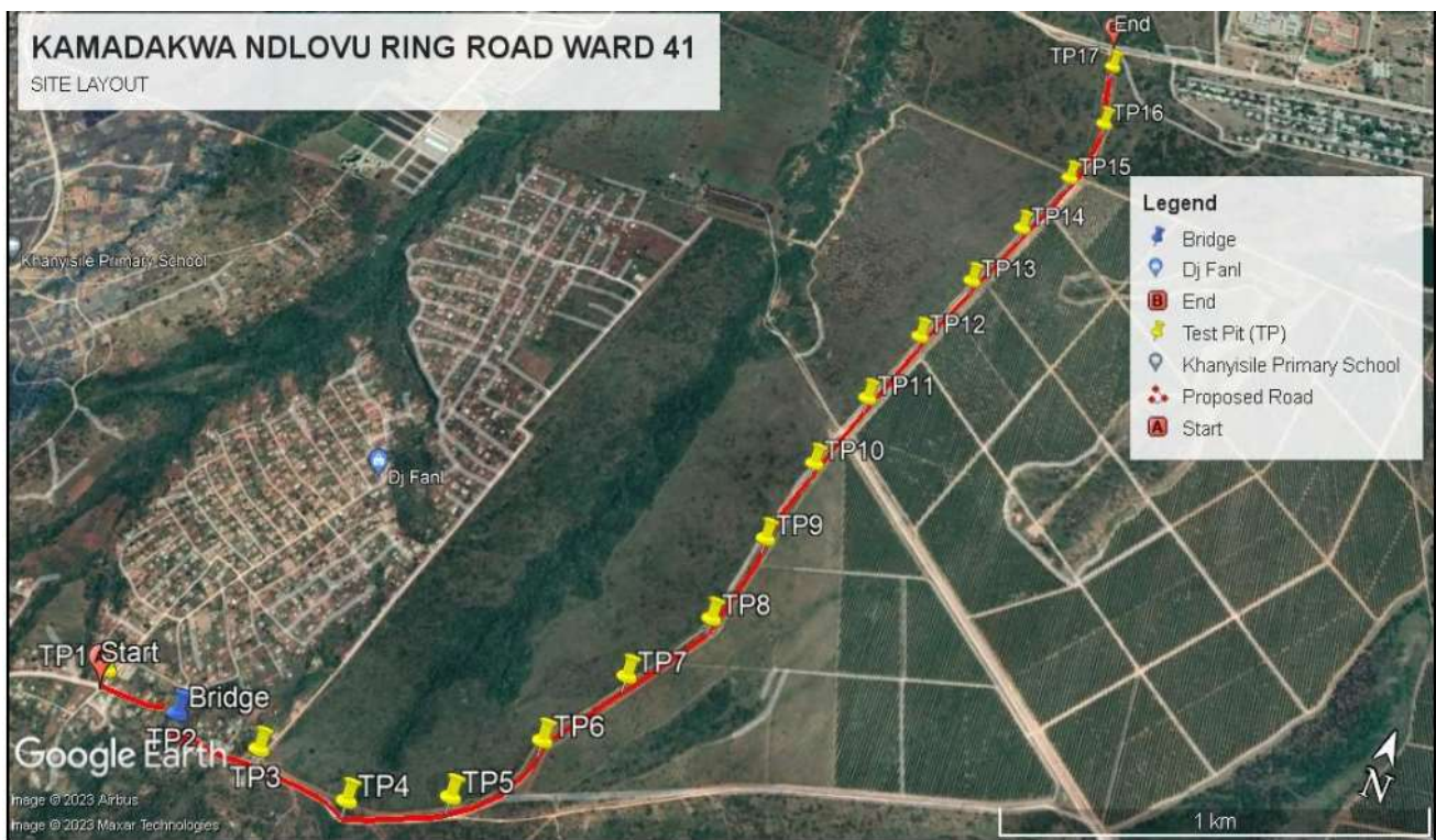
Figure 3: Location of test pits on CONSTRUCTION OF KAMADAKWA NDLOVU RING ROAD WARD 41

They were loosely backfilled with the excavated material. Figure 3 indicates the location and the coordinates of the test pits.