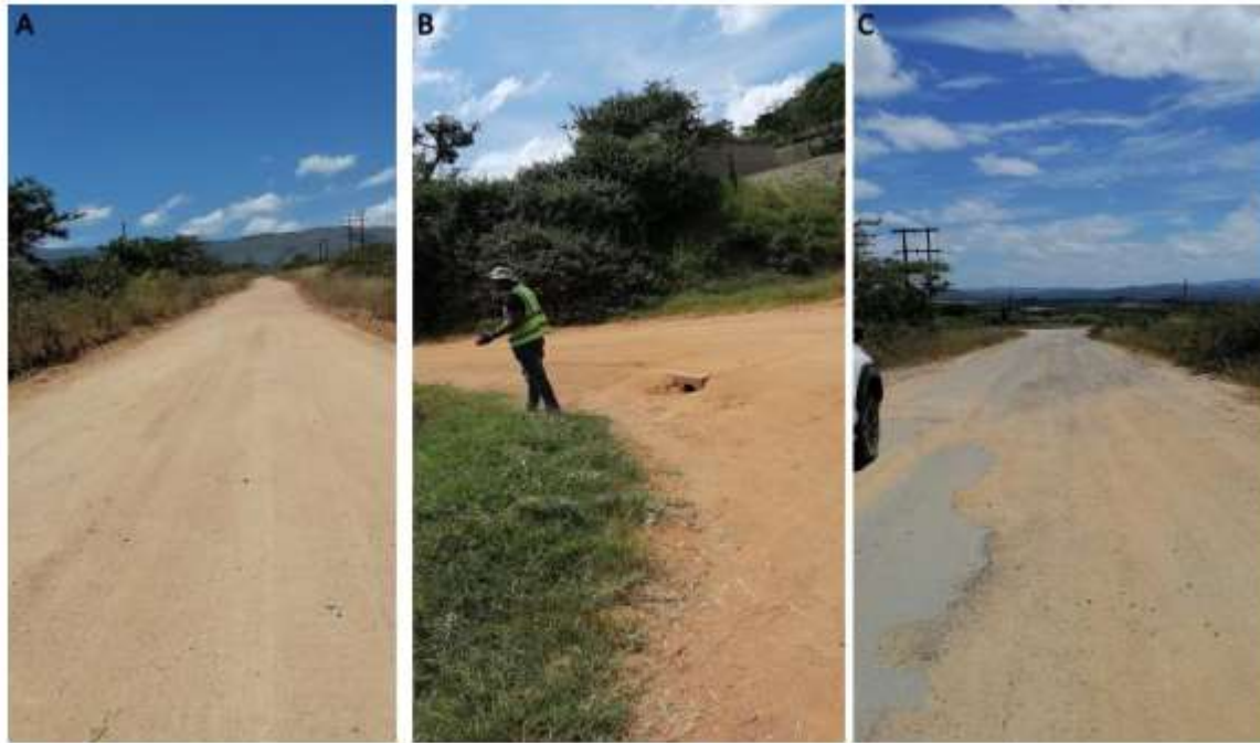
Figure 1: (A) Unpaved gravel road section, (B) The existing bridge and (C) Paved (asphalt) road section